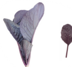
R6-553 F1 Komatsuna Purple leaf Purple stem