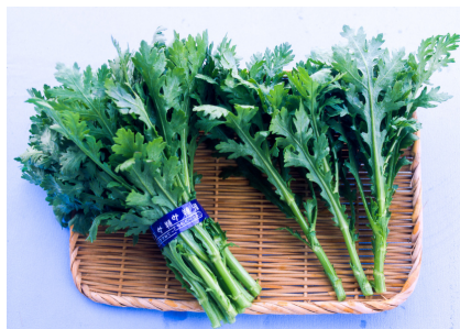
SHUNGIKU Chrysanthemum coronarium Edible chrysanthemum leaves, raw or cooked.