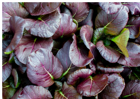
TSX-950 F1 Deep purple leaves with contrasting green stem.