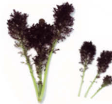
SCARLET FRILL Mustard Purple leaf Green stem