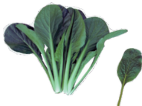
KOJI F1 (TSX-821) Tah-Tsai / Tatsoi Green leaf Green stem