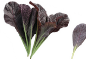
GARNET GIANT Mustard Purple Leaf Purple Stem