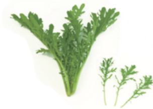
GOLDEN STREAK Mustard Green leaf Green stem