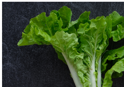
TOKYO BEKANA Brassica rapa var. pekinensis Non-heading Chinese cabbage. Available organic.