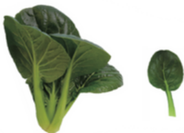
HOKUSAI F1 (TSX-813) Komatsuna Green leaf Green stem