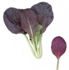
BV950 F1 Komatsuna Purple Leaf Green stem