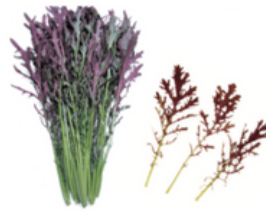
RUBY STREAK Mustard Purple leaf Green stem