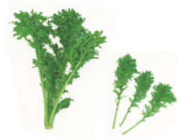
GOLDEN FRILL Mustard Green leaf Green stem