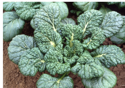
YUKINA SAVOY Brassica rapa (Pekinensis) Larger, savoyed Tatsoi with dark leaves and crunchy stems.