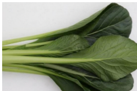
HOKUSAI F1 (TSX-813) Dark green leaves and stems. Good for baby greens.