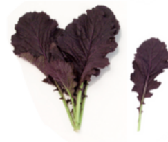
CRIMSON RED Mustard Purple leaf Green stem