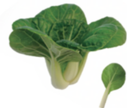
TSX-BV158 F1 Pakchoi Green leaf White stem