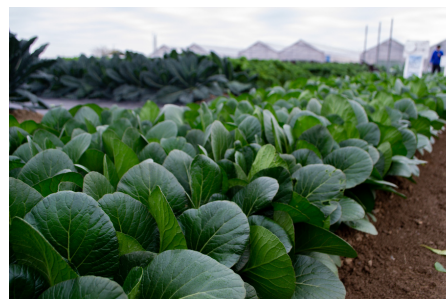
TSX-822 F1 Most adaptable variety. Good heat and cold tolerance.